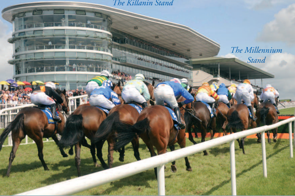
The Millennium Stand